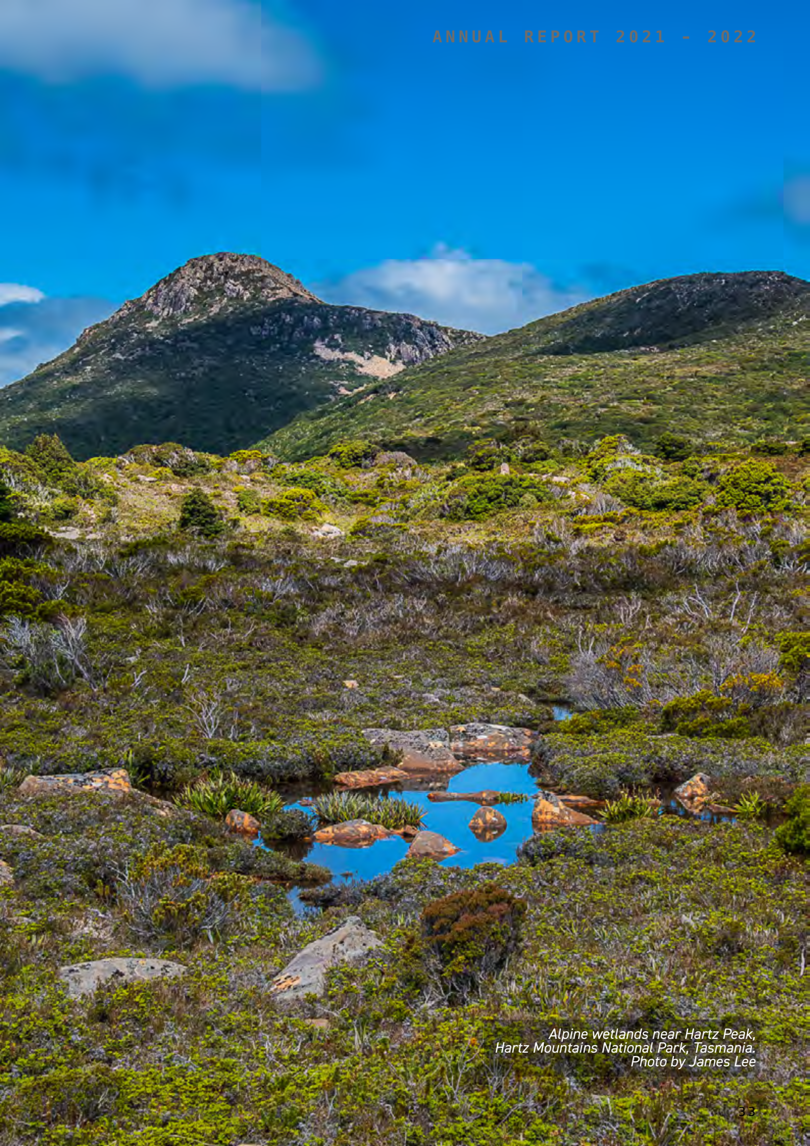
Alpine wetlands near Hartz Peak, Hartz Mountains National Park, Tasmania.