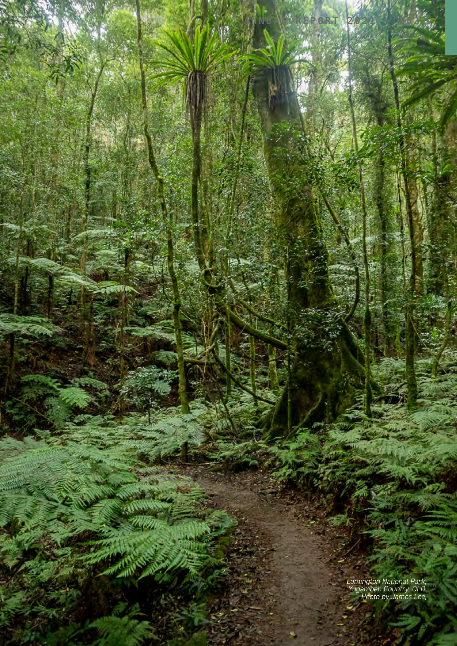
Lamington National Park, Yugambeh Country, QLD.