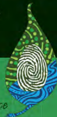
Above: The Greenprints Adventure info session banner