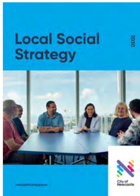
Newcastle City Council's draft "Local Social Strategy" document references the Greenprints approach. See pages 15 - 16.

After a range of discussions with innovative thinkers within the Newcastle City Council, AELA's Earth-centred program and framework, "Greenprints" has been adopted and referenced in the Newcastle City Council's "Local Social Strategy". Greenprints was referenced as a "strategy [that] will help our community to thrive while using our resources wisely and not exceeding the capacity of our ecological systems."