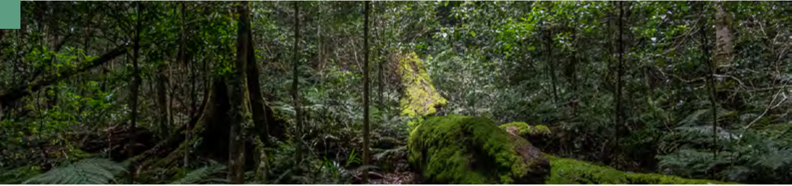
Lamington National Park / Yugambeh Country, QLD.