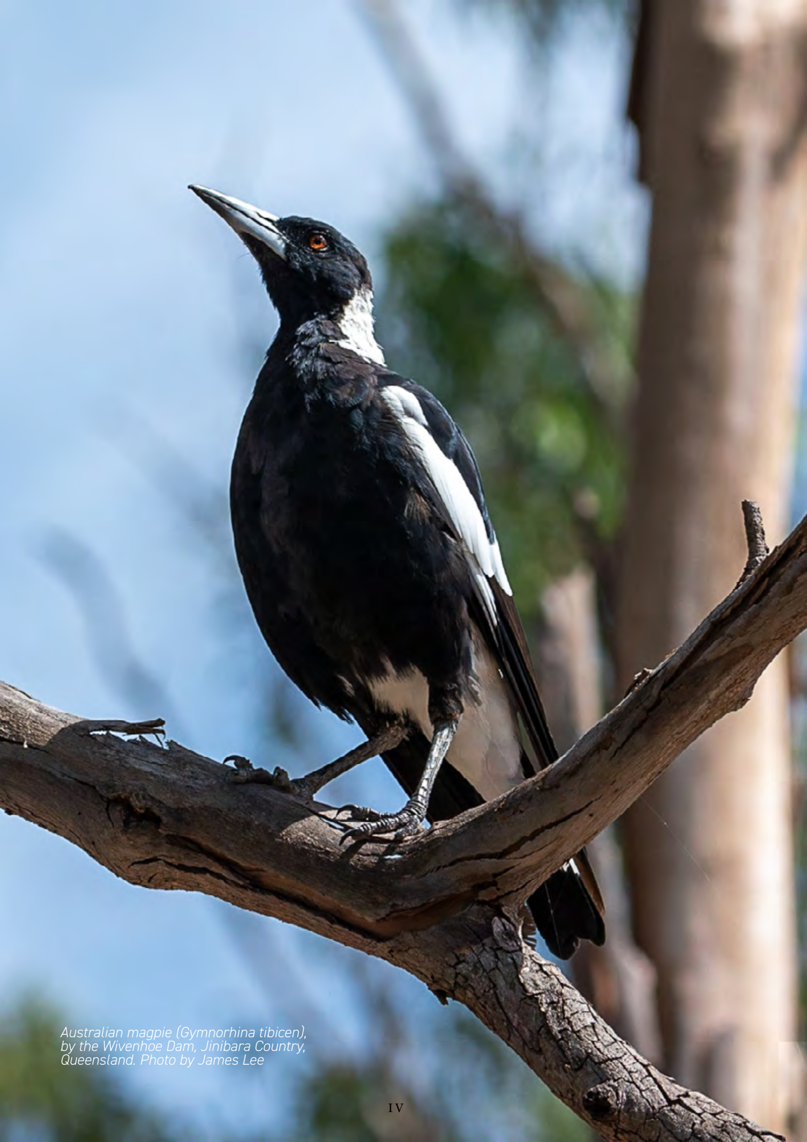
Australian magpie ( Gymnorhina tibicen), by the Wivenhoe Dam, Jinibara Country, Queensland.